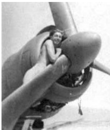
Can anyone name the aircraft ? OR NAME THIS CHURCH !

As an established club on the airfield and following the initial registration of existing known members at the 1 st of January 2007. We wish to advise that future membership is strictly by application and approval of the committee. We encourage people with a genuine interest in aviation.