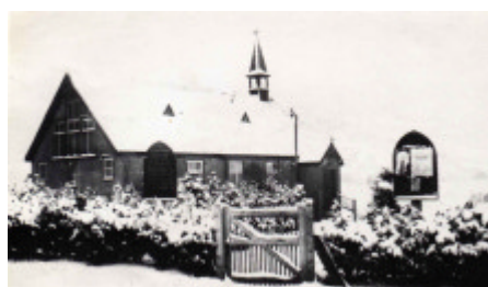
Which was built in 1903 for the princely sum of just £253