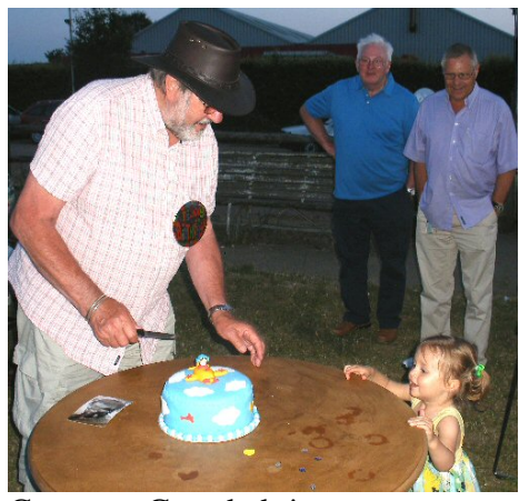
Come on Grandad..!

You have to cut the cake now before you forget why you are here I have two witnesses ready..!!!