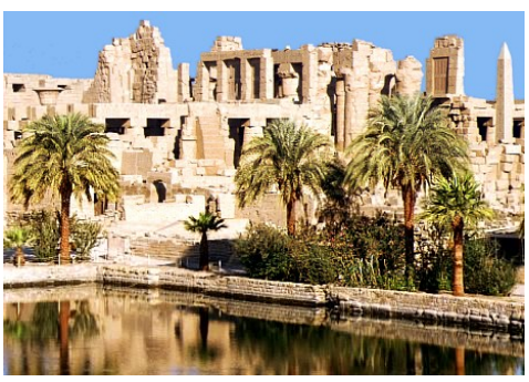
The Temples of Karnak, Luxor.

The longest river in the world wound its way through the endless desert. Its course could be clearly seen for miles ahead due to the green strip of vegetation stretching for about half-a-mile or so on either side, then petering out into the endless sand of the desert. 'Egypt is the Nile and the Nile is Egypt' so they say, and I can well believe it. Without her life-giving waters Egypt would never have existed as a nation of repute.