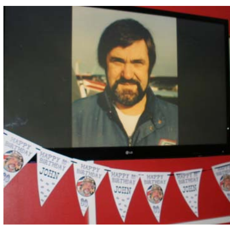
A TV screen featured many old pictures of JB in his younger days.