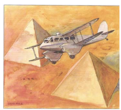
G-ALGC flying over the Pyramids

The Pyramids came into sight on our right; as we passed by the girls had a good view which cheered them up a little. They were a bit disappointed though smallness which, like most wellknown structures, appear enormous when viewed from ground level close up but somewhat small when viewed from up in the sky. Considering that the largest one, great Cheops Pyramid, the comprised nearly eight million tons of stone stacked forty stories high, they looked quite insignificant from our tiny aircraft.