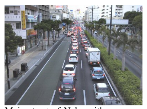
Main street of Naha with everyone on their way home from work. We head out for an evening meal to a Japanese Restaurant with a traditional floor show.

first cross the main runway for the light aircraft night parking area. Mr Mori drove around to my side of the airport and we then went to a nice hotel downtown Naha.