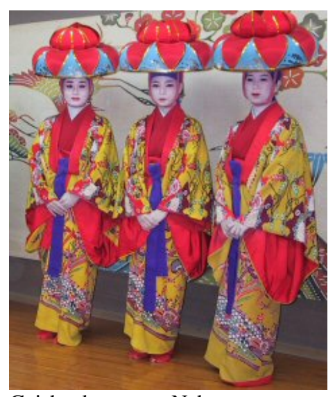
Geisha dancers at Naha restaurant.