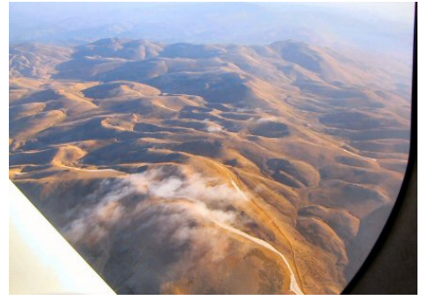
Crossing the mountains of Lebanon we head south to Jordon and Queen Alia International airport below.