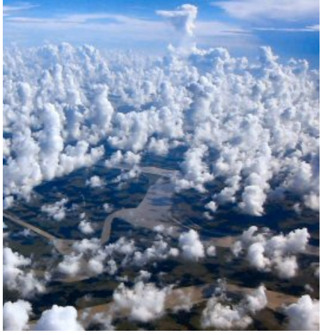
This scene from the Ganges Delta looks peaceful, but we were actually pushing a very strong headwind from the south east at altitude.

for taxi clearance. Can't see what the holdup is, as I am the only aircraft on the vast apron at Kolkata. It took another 50min to finally get released for the short flight to Chittagong, just 192nm.