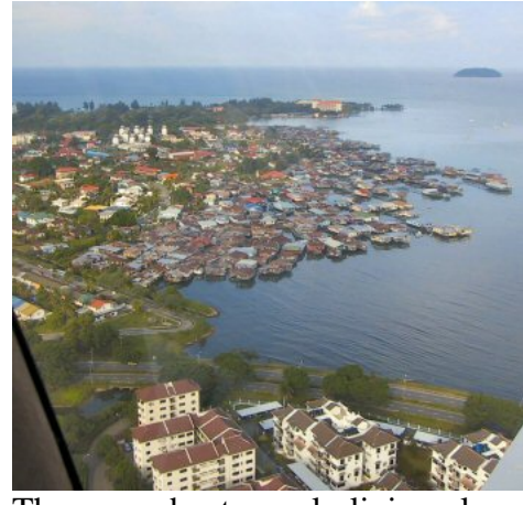
The many boat people living close to Kota Kinabalu airfield.

Another early departure heading north to Manila (Clark Field) in the Philippines.