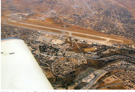
This airfield is 2,395ft a.m.s.l the temperature was 30c.

Having paid a landing fee he pointed out where it was on the map, 30 miles back to the North.