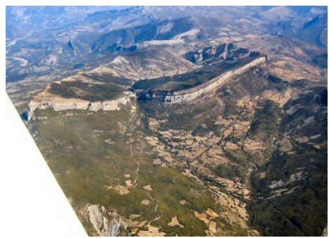
It was a beautiful day for flying as we pass the Central Massif.

Following some confusion by the Japanese Insurance company over the difference between EST and UTC I finally got airborne out of Biggin on the 15<sup>th</sup> September 2003, for Cannes (Mandelieu) for my first fuel stop.