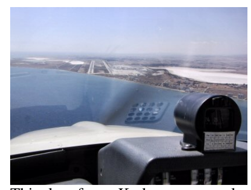
This leg from Kerkyra was only 4hrs 35min meaning arrival at Cyprus in time for lunch with the afternoon for relaxing.

Meanwhile I came across this unusual picture at my hotel in Larnaca.