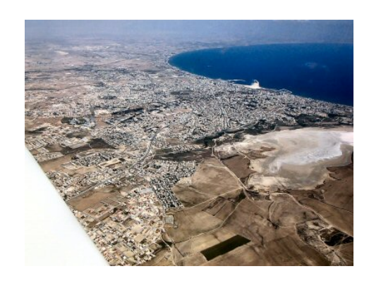
Long finals to runway 22 at Larnaca with a visible crosswind.

A couple of hours later the island of Cyprus appears.