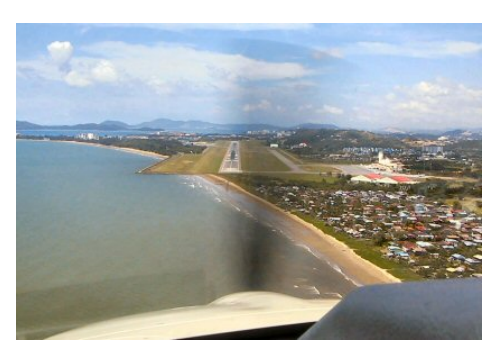
Final approach to Kota Kinabalu