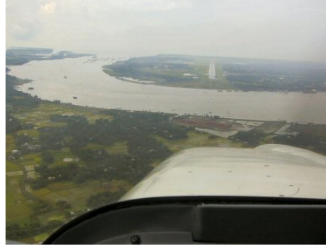
Chittagong comes into sight dead ahead in light rain.

This was a rather laid back place where the fueling took an hour, all measured to a gallon can and then poured through a chamois leather.