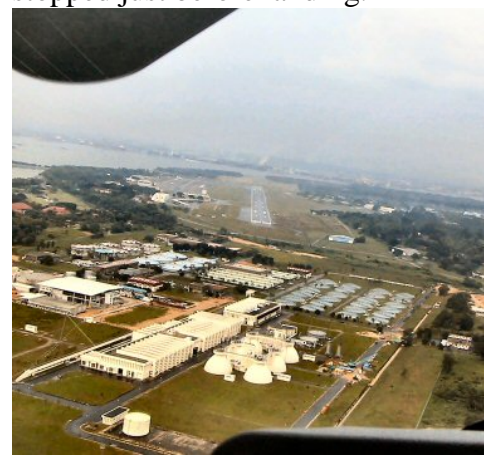
Final approach at Seletar, after 5hrd 40min. Another cool place with low formalities, leave your details on the appropriate desk and it will be dealt with in time for your departure.