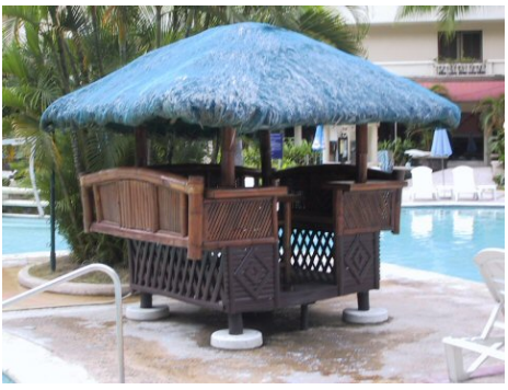
A pool side bar, ideal in hot countries.