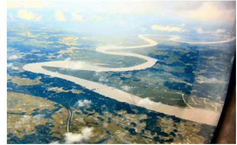
Climbing out of Chittagong the famous Irrawaddy river comes into

I wasn't in a hurry as the early morning wind was against me and the system looked to be moving away to the west fairly quickly, becoming a tailwind on the way across Myanmar and Thailand.