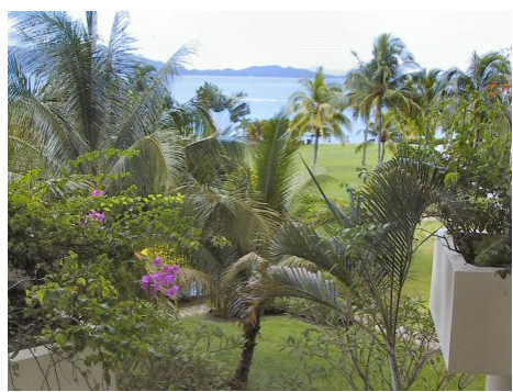
The view from my hotel room.