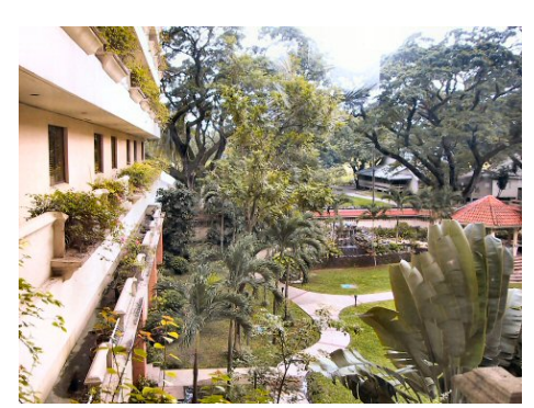
The view from my room was typically tropical.

Filed my flight plan for the next day to Naha, and retired to a very nice hotel outside the boundary of the airfield mainly for USAF personal, it was basically empty, but comfortable.