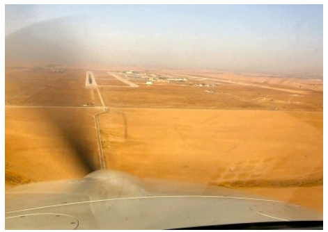
After landing and taxiing in, a very nice man came out and asked what I wanted? I replied 'Avgas 100LL'

I'm sorry Sir, we don't have any fuel here you will have to fly up to Amman (Marka).