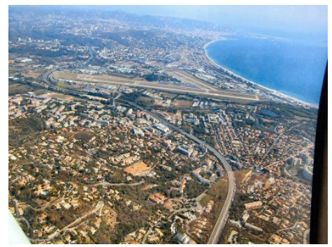
The magnificent Azure Blue of the Riviera finally comes into view.