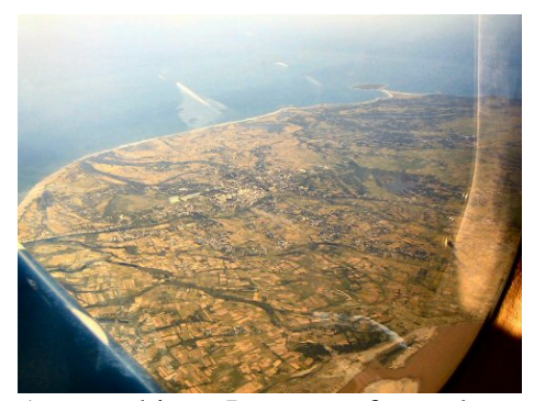
Approaching Laoag, of northern Philippines and the Luzon Strait.

Exactly one hour late I am cleared to go, I call my agent in Japan and advise arrival time at Naha, Okinawa will be one hour later than the planned arrival.