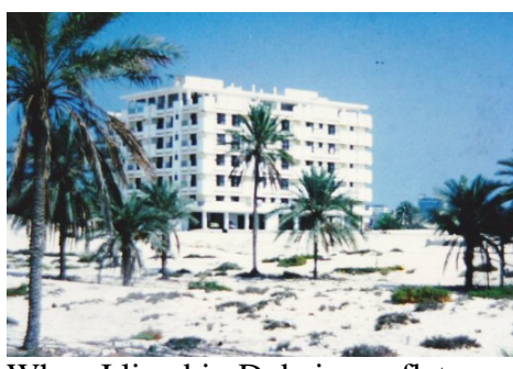
When I lived in Dubai our flat was in the middle of the desert, today it is totally surrounded.

I hadn't been to Dubai for a few years and the changes had to be seen to be believed.