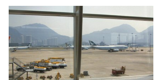
Hong Kong I change from JAL to Cathay Pacific for London.