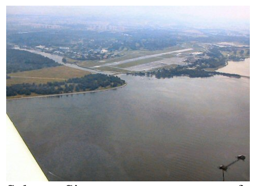
Seletar, Singapore appears out of the low cloud and rain which stopped just before landing.

The only snag here was the fact they wanted Malaysian Dollars for the fuel which meant a short walk into the terminal building to the bank within without clearing customs. How cool is that.?