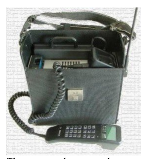
These were large cumbersome heavy units – Meanwhile, Lille continued being set-up as the new Control Centre.

There were no domestic computers around at this time, a few Mobile Phones.....!!