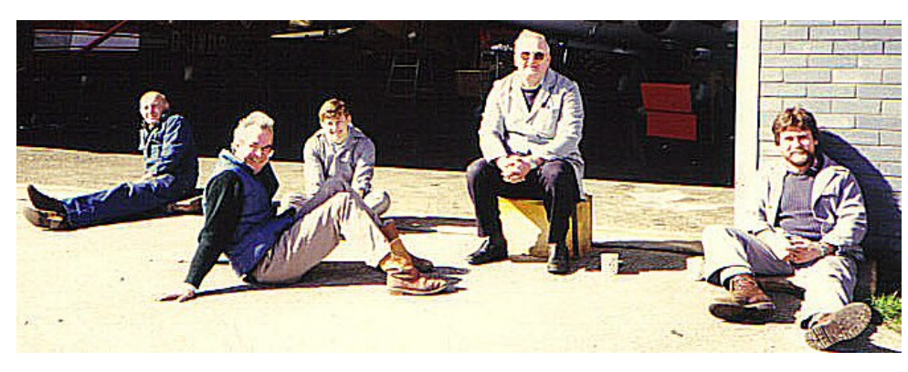
SUNSHINE AT SHIPPING AND AIRLINES DURING TEA BREAK

OVERHEARD AT THE BAR How are you getting to Cornwall? I'm catching a train from Paddington at 1 o'clock. Oh, what time does the train leave then – 13 hundred hours. ???