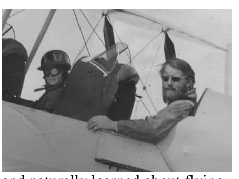
and naturally learned about flying

with his father in the Tiger Moth and other aircraft whenever he got the chance.