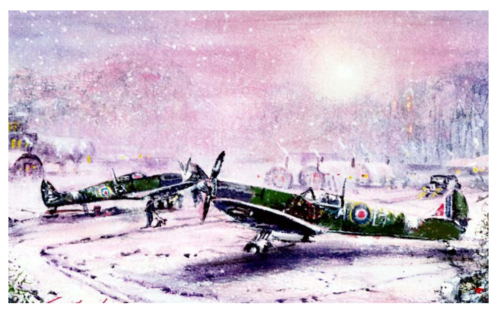
To all our readers where ever you may be, we take a moment to thank Our readers for their interest and support over the past years. Christmas is upon us yet again. We wish you all a Merry Xmas and Happy New Year From our new look Biggin Hill Airport

In Ass. with BigginHillReunited.co.uk {\bf 1}^{\rm st} \ \ {\rm December} \ {\bf 2014}