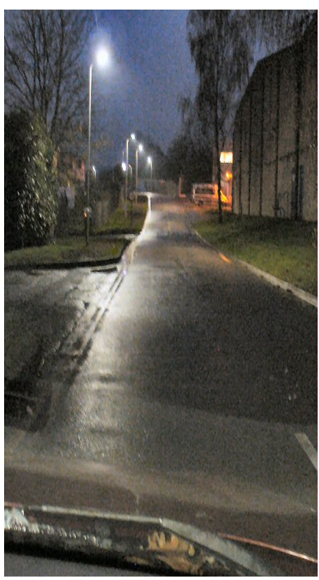
People can be spotted in the previous dark void.

The new lighting on the airfield is a great improvement.