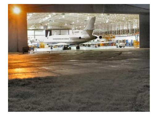
The well lit hangar of Jet Aviation helps to brighten the winter afternoons.