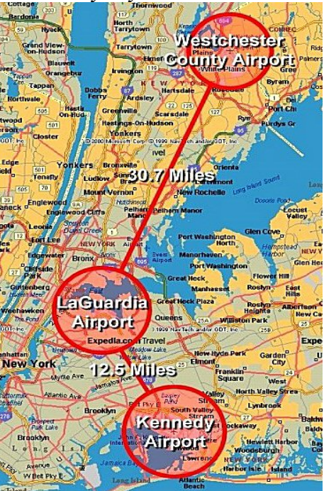
(The above map was inserted by Editor)

Editors comment: This was certainly a magnificent flight so close to a city like New York, imagine receiving a complimentary clearance to do a couple of circuits around Canary Wharf (London) on a local flight out of Biggin Hill.