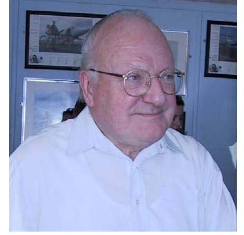
An charismatic gentleman, smartly turned out at all times whether it be at the wheel of a racing car or the controls of an aircraft sadly passed away on the 14<sup>th</sup> January 2010.

Gordon was a quietly spoken, astute businessman who owned a Black Cab Taxi Company, selling or leasing cabs for many of the Black Cab taxi drivers around London.