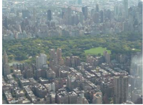
back to White Plains with a right hand join downwind for