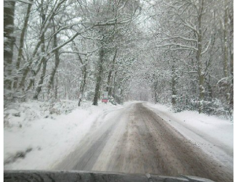
the roads of Kent and beyond, with cars being abandoned by their owners. Others drove on despite