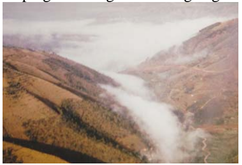
This is also Gorilla country. Wow!

engine failure with the ground sloping at an angle of 45 deg angle.