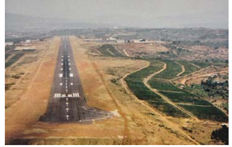
Kigali, when it is dry is quite nice.