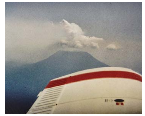
The active volcano of Nirangongo near Kigali rises to 11,384ft.

Stay friendly, get their name and phone number; don't forget the country code.