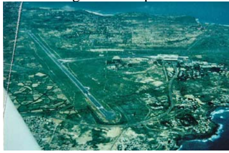
Overhead Dakar, with the original airfield top right.

The hazy conditions that prevailed to the north vanish to a lush green surrounding Dakar airport.