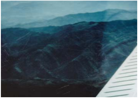
The Atlas Mountain range rising to 13,665ft at Torbkai further inland as one approaches Agidir airfield'