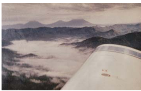
Another day around Kigali with the active volcanoes of Nirangongo, Kirimbi and Mweno all towering toward 11,000ft all active.