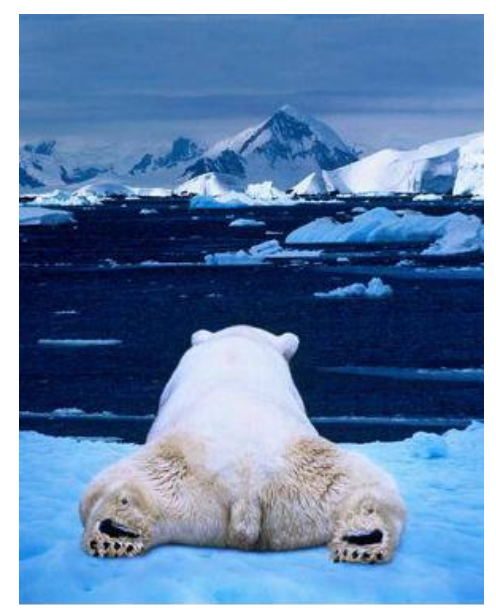
Ah! I can see it now - it will be an ideal spot for a bar on the other side of the bay - no problems with heat and just a brief swim there and back.