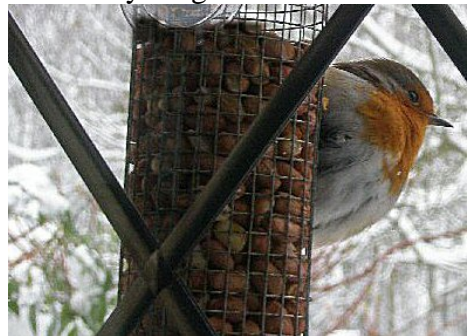
without unnecessary brutality. The