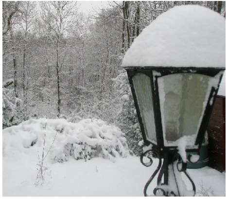
Buy the editor a couple of Stella's and everything could be revealed

Our man in the field captures these tranquil moments in time over a landscape which has been annexed for his personal use. This location is a closely guarded secret and will not be revealed, even under torture.