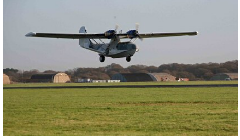
Below is a picture before departure from Lee on Solent.