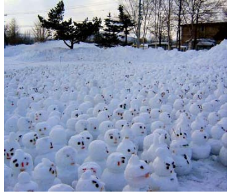
could spell the end of these little snowmen on our christmas cards.

Protesters were out in force at an open air rally this week to represent the seriousness and the effect of global warming is having on their future – they could become extinct in just a few more weeks which