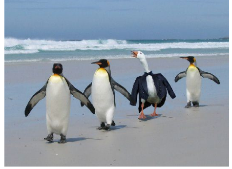
already spotted the deliberate mistake in the above picture.

Antarctic holidays are being sponsored for the pets of Bugle readers. The picture below shows Tufty the Goose taking a stroll with some Penguins along the beach of Antarctica, several pilots from Biggin have flown to and around the Antarctic region and will have