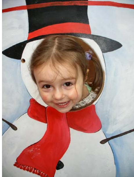
Happy New Year to all the Bugle readers, good luck for the future.

Xmas decorations of one of the pilot owners, at Biggin Hill who has a wonderful display of Xmas decorations each year at his home in Hays Lane, Bromley.