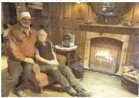
Huge treasure found also.