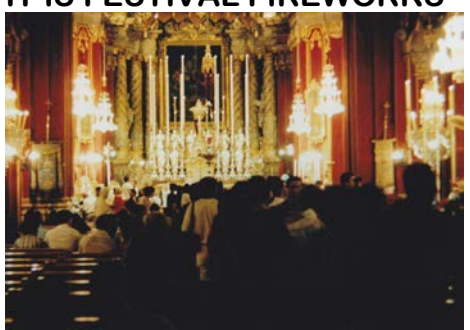
It seems we have arrived in time.