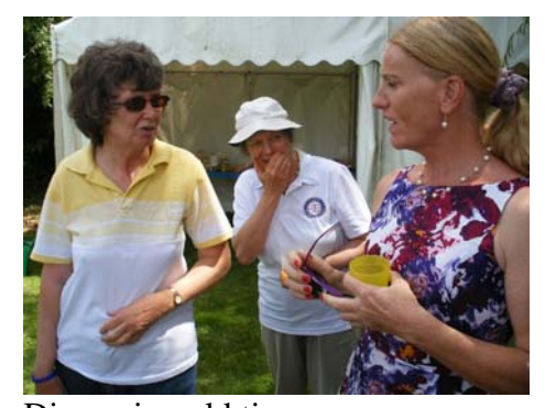
Discussing old times.