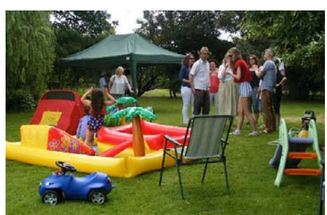
A water feature for the young'uns.