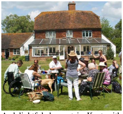
A delightful day out in Kent with some pretty women and contrasting shadows.

The sun shone gloriously for the whole of the afternoon (30<sup>th</sup> June), plus a huge crowd, and a dog fight to boot...!!