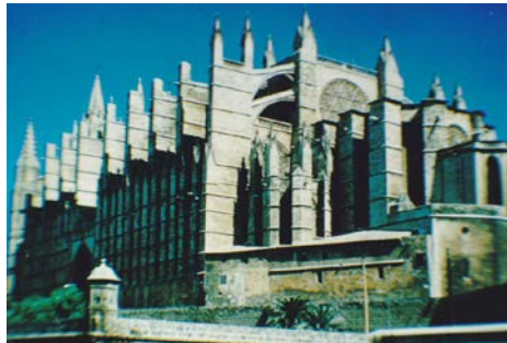
We had a look around the Palma Cathedral which was very impressive. Later in the afternoon we decided to attend the Bull fight.

Whilst it is some what spectacular it is totally unfair for the poor animal which is injured by the Picadors on horse back prior to the actual killing.