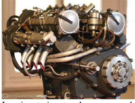
Imagine trying to change a spark plug in a hurry during a race.

Despite their complicity and confined space these engines could achieve 170 mph even in these days producing 75 bhp. Todays machines are capable of 180 mph plus and 150 bhp with turbo charges to boot.