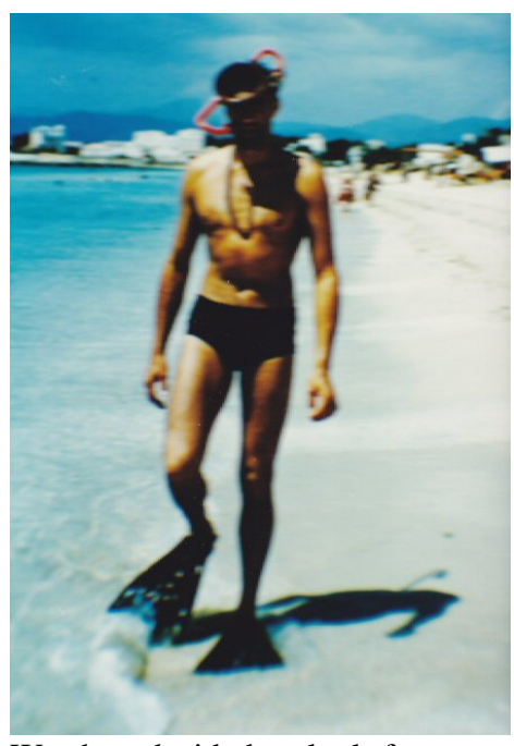
We then decided to look for some girls. Must get dressed first.

This was our one and only visit to a bull fight. I went for a swim at Palma Nova a nice deserted beach. Today it is built up beyond recognition.