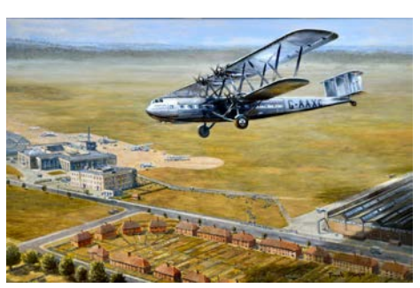
A pioneering airfield of the thirties

Despite my early wanderings over the last two years I still hadn't been to Croydon Airport which was under threat of closure according to the newspapers.