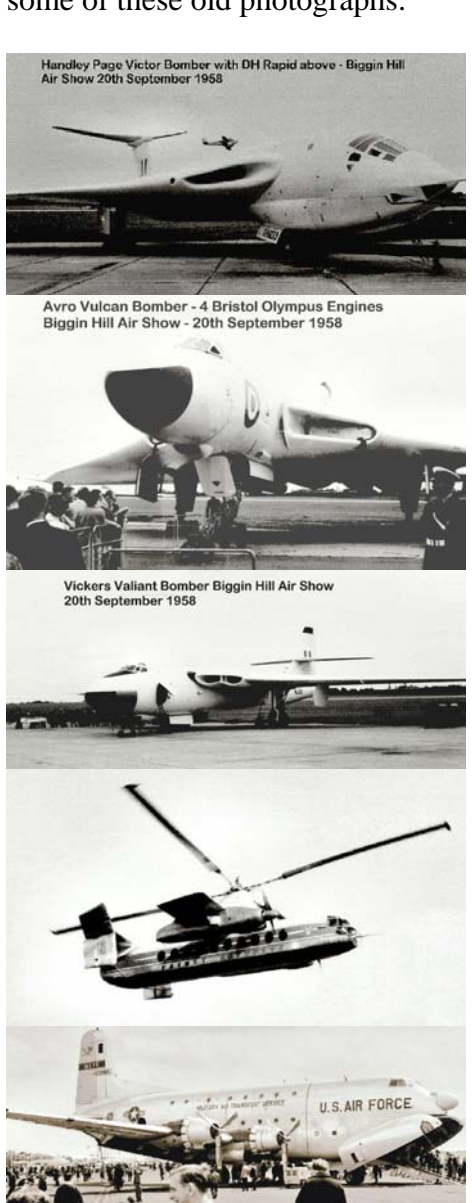
These were the halcyon days of the

The editor like many others has attended nearly all the Biggin Hill shows since the beginning. The early shows created huge traffic jams inbound trailing back to Bromley, & Westerham. Exiting after the days flying was even worse with people still trying to get out up to 9 0'clock in the evening. How many of you can remember some of these old photographs.