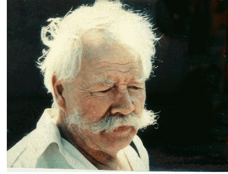
Perhaps a little 'Grecian2000' and some 'Anti-ageing Cream'