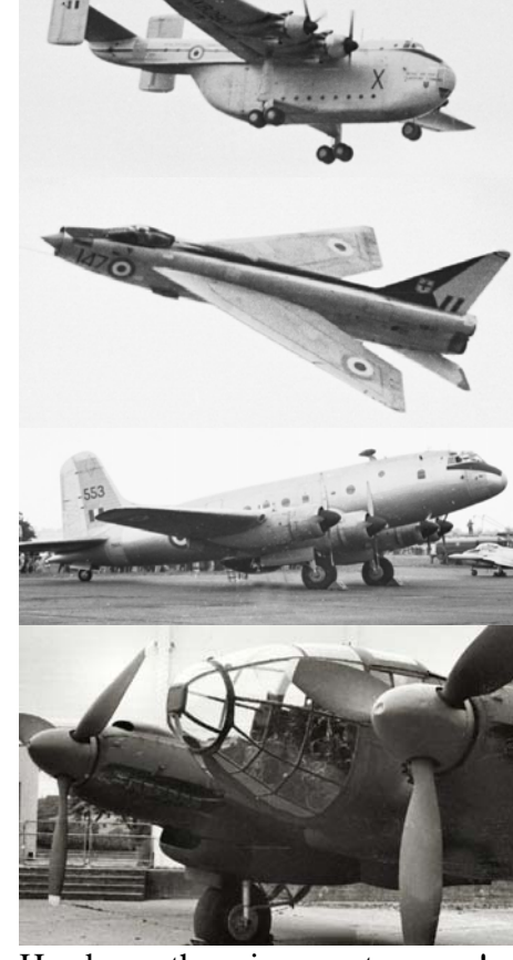
Heads up, there is more to come!