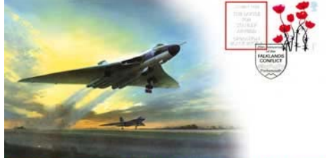
25th Anniversary of the FALKLANDS CONFLICT The RAF joins the conflict

bomb the airport at Port Stanley during this famous conflict to deny the Argi's use of this valuable landing ground. Three Vulcans were deployed, staging from the Ascension Island which was 3,516nm from Stanley. This successful raid was carried out during the night, flying for 15hrs 45mins for the round trip with in-flight refueling several times.