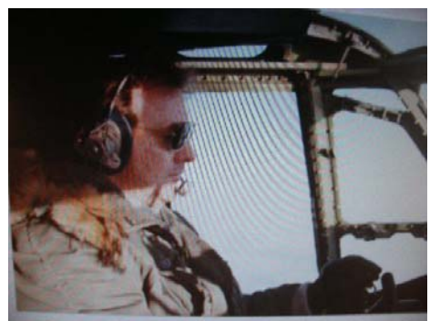
Cabin heating was not a priority in the Bristol Freighter hence a thick jacket was the order of the day.

The freight bay below had no heating at all as the aircraft was not a long haul machine.