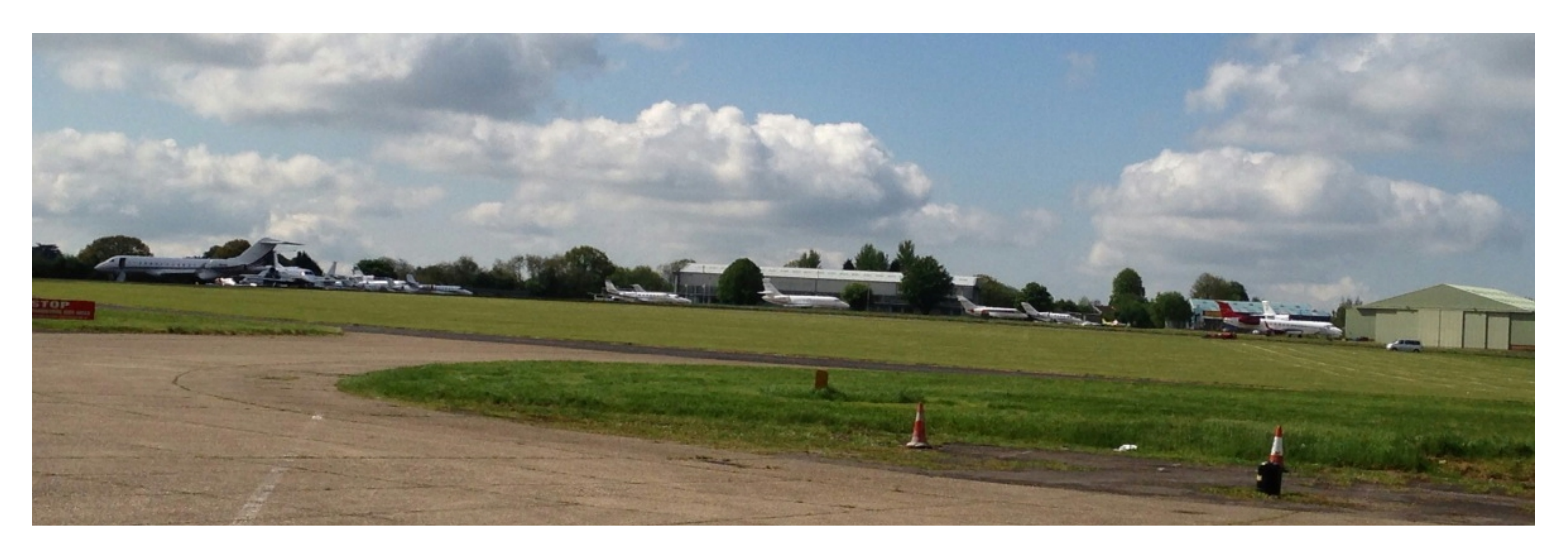
Runway 29/11 (29 threshold and Southeast Apron)

Biggin Hill Airport did what it does best – and showed how it is not intimidated at all by such traffic and appeared to cope admirably. Very impressive line out..