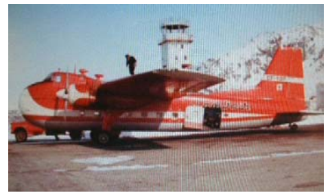
With a Bristol Freighter bound for Canada – looks rather cold.