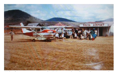
Flying around Uganda is the only way to travel, where roads are rare.

Uganda is a large state within the large continent of Africa where communication was rather remote in these early days and fuel supplies were another desperate commodity and fiercely guarded.