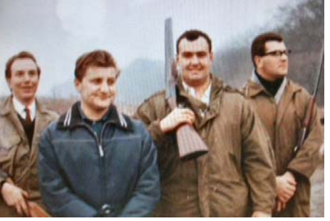
When the weather was bad at Biggin Hill, a little bit of clay pigeon shooting would be the order of the day over at the rubbish dump.

The freight bay below had no heating at all as the aircraft was not a long haul machine.