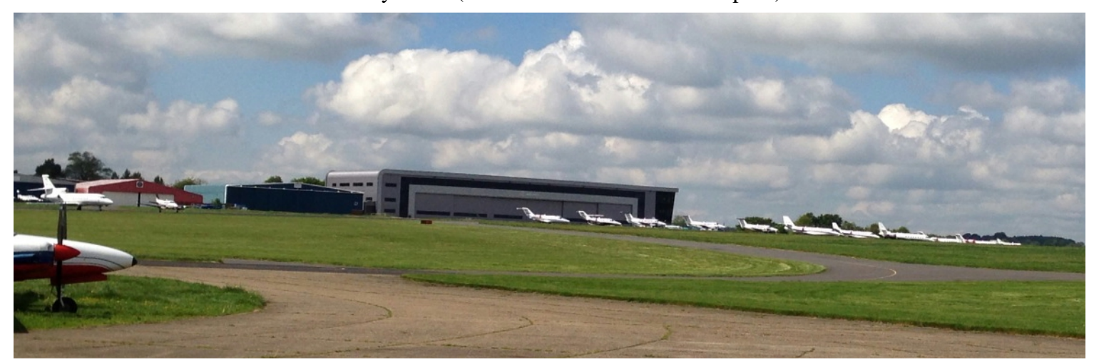
Runway 29/11 (Western end with Rizon hangar behind)