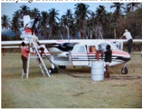
Re-fuelling by hand in the far east.