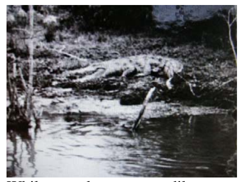
Whilst a large crocodile suns himself on the river bank before his breakfast until he warms up enough to make an effort to eat.