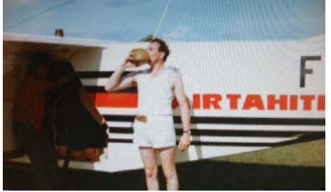
A real Coconut drink no alcohol.