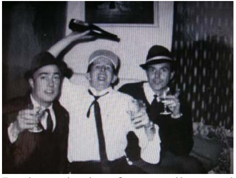
Back to the bar for a well earned drink and some new ideas.