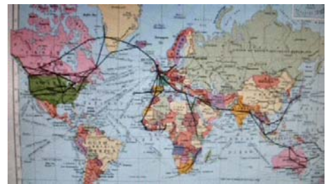
Don's travels around the world are depicted on this map.