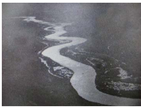
The White Nile originates in Uganda and flows north toward to Cairo and the Nile Delta.

Uganda is a large state within the large continent of Africa where communication was rather remote in these early days and fuel supplies were another desperate commodity and fiercely guarded.