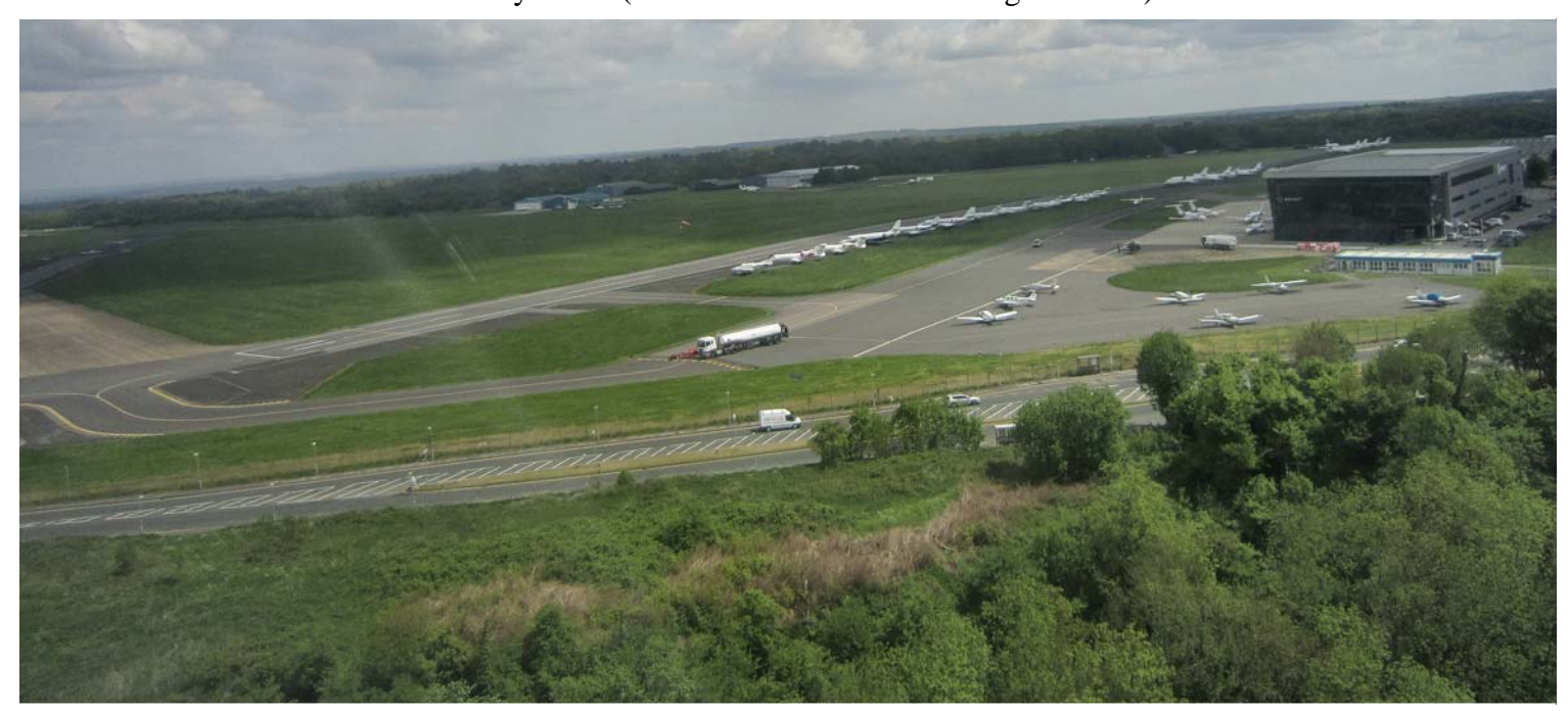
Runway 11/29 (viewed from short final to 03)