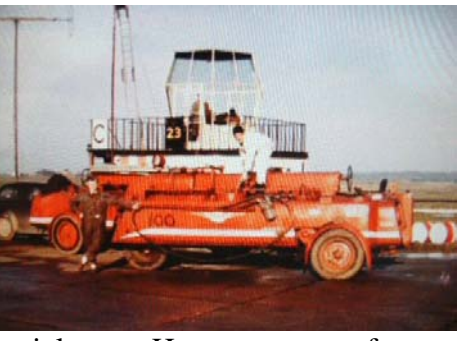
article. How many of you remember this early 3 wheel self propelled fuel bowser outside the old civil tower at Biggin Hill.

Quality cameras weren't an important item in his adventures he made up an album with some interesting pictures featured in this