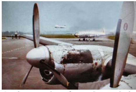
A picture taken from the cockpit, at Southend, during the Carvair days when it was possible to fly your car to Le Touquet.

Don with his team were told to leave immediately for their safety.