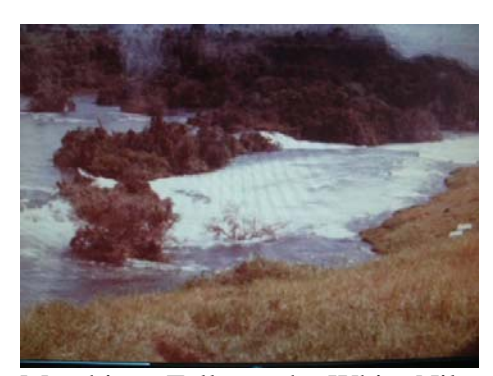
Merchison Falls on the White Nile, Uganda, through the lens of Don's camera. ( In colour...!! )