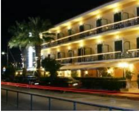
This is still a very good hotel today, walking distance from the airport. The price has risen with the times (£54) but discount is available for aircrew

anything. I hung around the airport for a while, enjoyed a very nice breakfast, then walked back to my friendly family 'Hotel Bretagne' which was only $12 US daily.