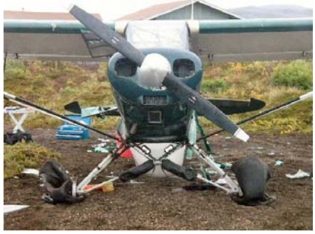
to prove the quality of his teeth.

The pilot, not to be outdone, smiled and showed 'his' pearly white teeth as he called another pilot on the radio to bring him two tyres, three boxes of duct tape and a couple of sheets of plastic.