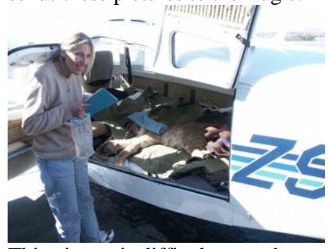
This picture is difficult to see here,

SAVING LIONS OF AFRICA Our Pilot correspondent of RSA sends these pictures to the Bugle.