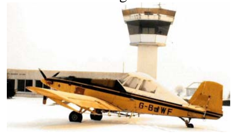
as you head for the continent of Africa and the golden sunshine.

in France, with the knowledge that the weather will get a lot warmer