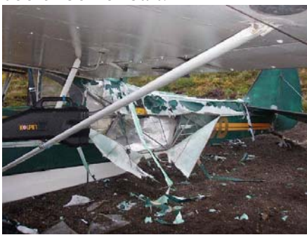
The bear even punctured the tyres

What do these two items have in common? One of our members sent this delightful story of what can be achieved in a desperate far from home situation with some skilful assessment and common sense approach to a quick fix to a fishing trip in the outback of Alaska that went slightly wrong. The pilot chappie and fisherman friend left their excess fishing bait in one of those secure cooler boxes in the aircraft, whilst they went to the river bank for a bit of fishing - they were lucky they didn't take the extra bait with them..! Bears have an exceptional keen sense of smell and are able to sniff out the minutest whiff of anything edible from a mile away. Their aircraft was no deterrent to accessing the cooler box of bait.