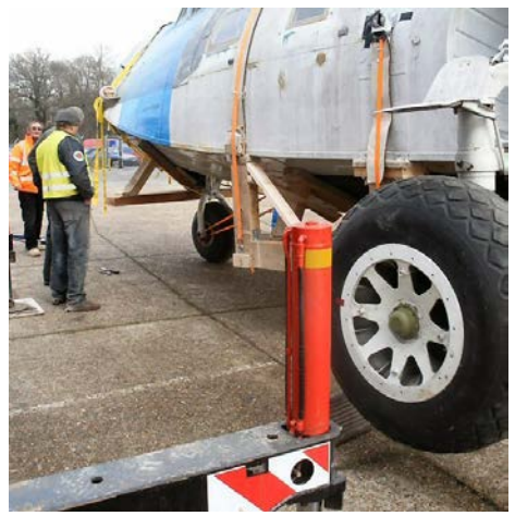
Testing the initial lift for loading from the wing attachment point was a little bit nose heavy.

Removing the nose wheel corrected this problem perfectly.