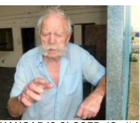
HANGAR IS CLOSED. 'Op it.!