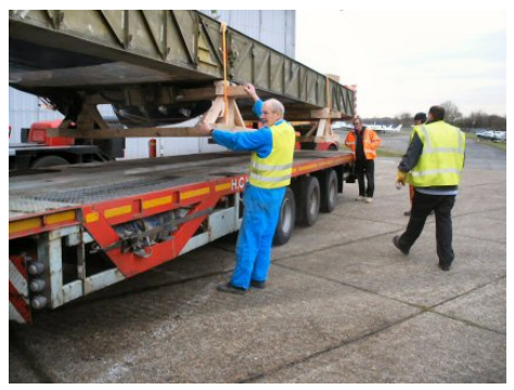
This centre section was 27 inches in depth and 8 feet wide. Basically a fuel tank, the outer wing sections tapered toward the wingtip were 30 feet in length. They too, were part of the fuel tank.