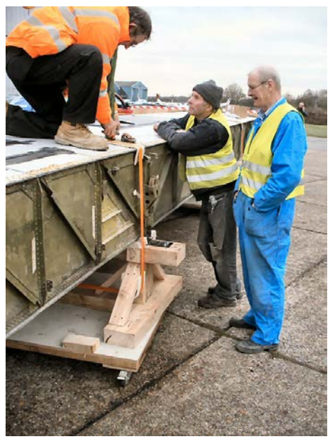
Attaching trestles, for lifting onto the second transporter.