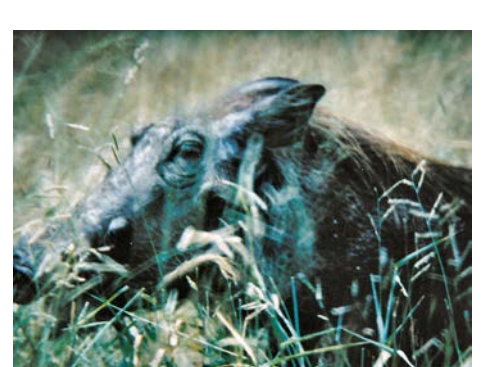
Easily disappears within the undergrowth and a very aggressive in this environment.

Given a Lion a run for their money armed with two short tasks which can injure other predators who think they are going to get a nice meal!!