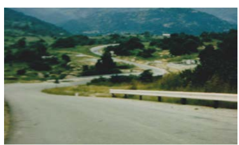
I stop to take in the view before continuing into town and hotel.