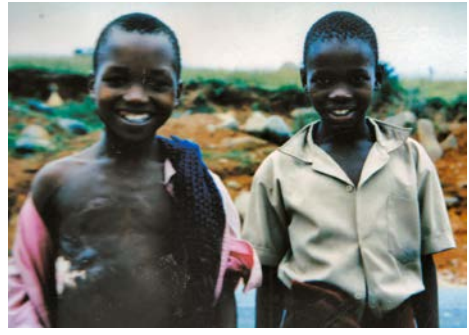
Arrive on their way home from school which was about 500 feet down a steep hill below.