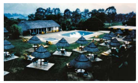
I used Holiday Inns exclusively for my travels for a long time for their favourable discount terms with my Crew Pass, up to 40% discount.. They all had good pools