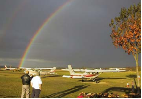
Somewhere, out there is a memory!

When the Pilots Pals Bar was demolished the Rose bush was expertly removed to a members garden for safe keeping for the memory of 'Otto'