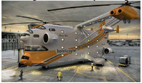
There appears to be eight engines to power this 18 roomed flying hotel with mini bar – internet café.

REVOLUTIONARY HOTEL This unique "Hotelicopter" development was sent to the Bugle by an avid reader. Believe this if you can, the throbbing vibration of the rotors lulling you to sleep or adding to the sensual pleasures of an in-flight all over body massage.