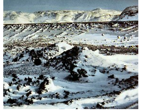
Central Iceland is fairly rugged and not easy to cross in winter. As this

The approach to Akureyri on the north coast of Iceland shows the black volcanic soil a feature of the coastline for this country. This airport was developed in 1955 as a gravel strip, converted to a tarmac surface in 1967 - it is in the estuary of the river Eyjafjardara. Today it has a large terminal building with the runway lengthened to 7,874ft with an ILS being added to diversions accommodate from Keflavik when required.