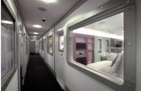
makes flying not only comfortable

The interior is something special, the price per room – or flight..??? The Bugle is hoping to have a representative on the inaugural flight to be taken soon. If you think flying is scary, consider being aloft in this huge monster. The interior is pure luxury which