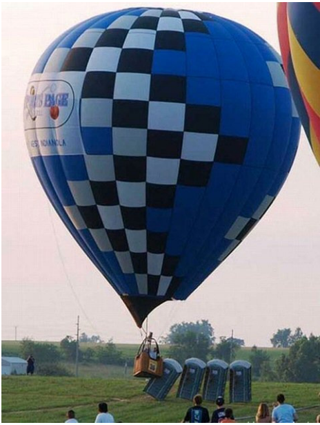
Hey, What the? Oh shit..! The pilot said afterwards, he panicked as he lit the burner and held the gas handle down and rapidly left the scene, claiming circumstances were

Can you imagine the contents of this very casual early morning balloon departure flight..!