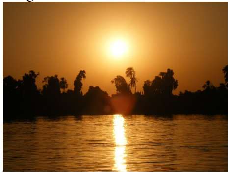
Overheard at the bar – Isn't there a river nearby, 'now what was it called'?

The bugle hopes that its readers wherever you may be enjoyed a very nice Easter – the weather was certainly hot and sunny, and the pubs were empty, where did the people go? Perhaps they were watching the setting sun at Kingston-on-Thames: