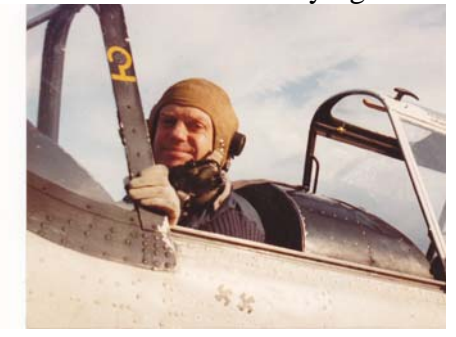
DH Chipmunk, with 600 Squadron.

In 1959 Ron went to Croydon Aerodrome and started flying in a