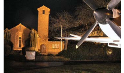
A large crowd gathered at the RAF Chapel on the 25<sup>th</sup> April 2012 for a