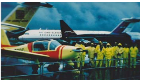
The picture above was from a very wet Farnborough Air Show with the yellow clad ground crew posing for a colorful scene.