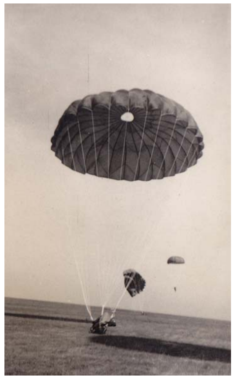
If you walk away from this, it is a good landing

Eventually he became a Director of this company, in the meantime we will thumb through his life's photo album.