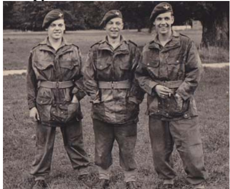
Did the enemy know what was waiting for them across the channel. We think, this is why 'Sea Lion' was cancelled.

Undeterred he joined a Parachute Regiment which meant he could at least be flying, if only for a short time before jumping out of the aircraft and flying under a silk canopy.