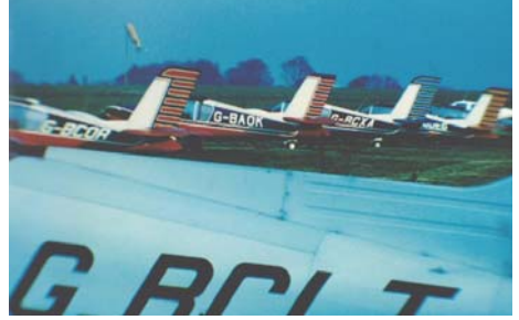
The colour schemes were designed by the editor (who was the CFI) at this time.

The hangar originally designed to house aircraft became a full maintenance facility.