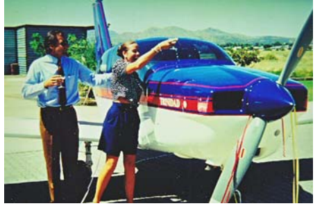
This aircraft had exceptional endurance and range with a wide comfortable cabin.

This was followed by the TB range of aircraft TB9, TB10, and TB20.