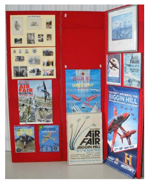
It was estimated there were some 270 people packed into the Chapel

On entry the editor and colleagues were destined to standing only when the Reverend Chris Baker guide them to some seats adjacent to the altar where the choir normally sit and informed us that we were expected to sing loudly..!