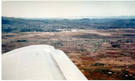
Downwind, at Blantyre. Malawi.