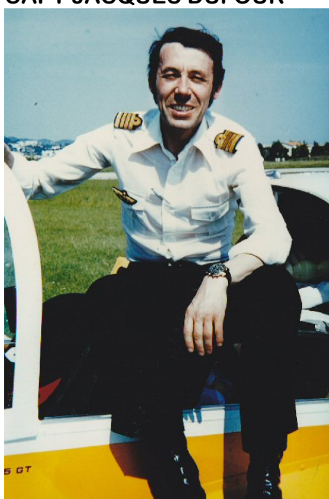
With his aircraft at Cannes,