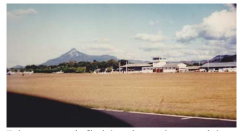
Blantyre airfield, nice place with a good hotel and a hire car, with instructions to pull off the road if the Presidents entourage is seen coming in your direction.

Tomorrow we are making a technical stop at Beira, Mozambique as it is still somewhat unsettled in this country for the moment and remained uncertain for several years to come.