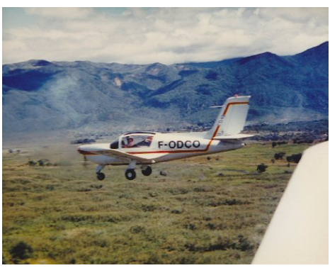
Flying out of Nairobi shows the height of the ground nearby rising to 9,000 ft and caution is needed when departing in bad weather.

This is a very busy airport in Africa, being in the centre of the country where there are few roads and most people are traveling to Safari Parks with supplies to support all the staff in those areas.