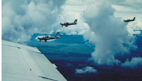
I had suddenly become their leader.

As we got nearer to Nairobi with high humidity some massive Cu Nim's developed and from a loose formation it seemed everyone was closing on me.