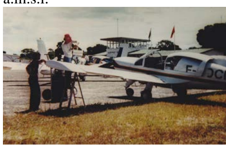
From here we will fly down the Western shoreline of Lake Malawi to Blantyre which is as far south in Malawi we can go, near the border of Mozambique, which is a bit unsettled at the moment.

This is all done by hand pump and chamois leathers to filter out any impurities. Karonga is 1,762 feet a.m.s.l.