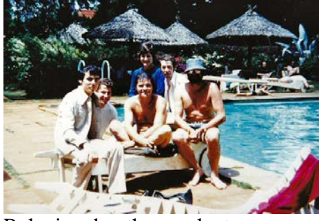
Relaxing by the pool at our very nice hotel near Narobi Socata ferry crew: