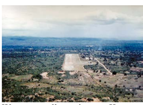
We eventually arrive at Karonga for a re-fuelling stop.

This is all done by hand pump and chamois leathers to filter out any impurities. Karonga is 1,762 feet a.m.s.l.