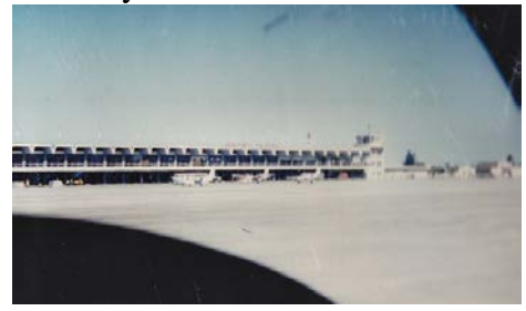
Beira airport, Mozambique we only stopped for customs clearance across their country.

Tomorrow we are making a technical stop at Beira, Mozambique as it is still somewhat unsettled in this country for the moment and remained uncertain for several years to come.