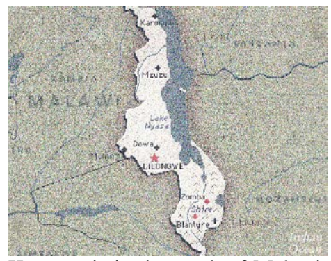
Karonga is in the north of Malawi. Blantyre is in the south.