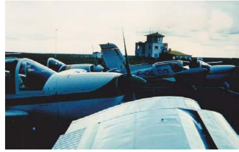
Filing our flight plans we are ready to go fly.

We are at Nairobi Wilson early for our departure to Karonga in Malawi (The Heart of Africa). There are some serious hills rising up to 12,000ft as we head South.