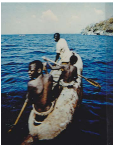
Many fisherman can be seen on Lake Malawi.