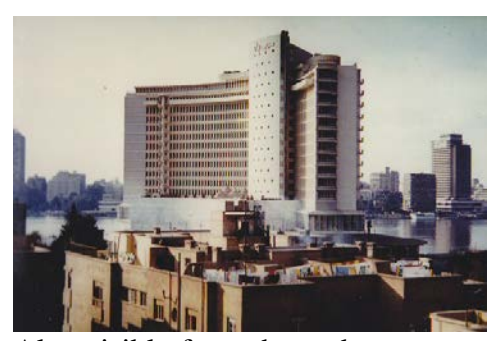
Also visible from the embassy was the Sheraton Hotel our abode for the night.