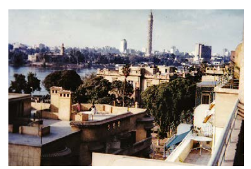
The rear balcony of the French Embassy showing a roof barbecue across the street,

There seemed to be a slight misunderstanding as we had told them to wait for us. They thought we were staying at the Embassy, and now they have to carry the bags back down the dark and rather hot stairwell.