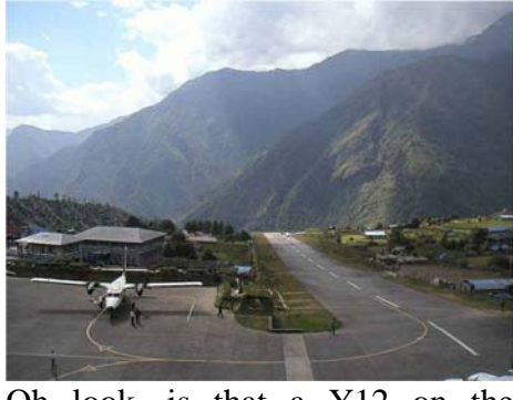
Oh look, is that a Y12 on the apron?

At this airfield, because you can see very clearly what you will hit, if you get it wrong. Houses near the runway will get your utmost attention whilst landing and departing, even the casual pedestrian strolling over your right of way – he will casually avoid you