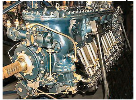
fitted neatly into cylindrical cowlings. A supercharger helped maintain power at altitude and it ran on 87 octane fuel.

combining two Gypsy six inline engines which must have sounded really great in flight. Each 12 cylinder power unit developed 525HP. The engine being quite unique for this period of the halcyon days of aviation, and they