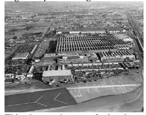
This is a picture of the huge Lockheed aircraft factory in 1940 at Burbank California that became

is a form of deception on a grand scale as many of us old soldiers understand, but once your cover is blown, it then becomes less effective. The following story is a classic example of maintaining a huge deception during WWII