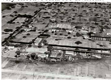
Study this picture to see the vast difference in appearance of the aircraft factory. Below is another

a worrying factor because of a possible bombing raid from the Japanese, who had bases in the Aleutian Islands, which was only 2100nm away. With the assistance of the Army Corps of Engineers they camouflaged the whole area with netting and other devices into very effective rural sub divisions.