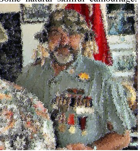
Even the editor tries his skills at blending in with his immediate

surroundings. He is brilliant at camouflaging 'his round' money..!