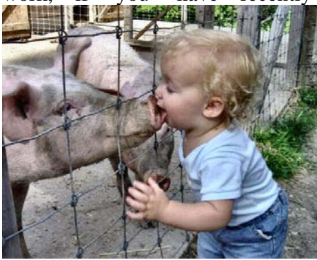
witnessed a rural scene such as this in the last few days, you can almost claim to have become infected...!! Anyone for a bacon sandwich?

It is probably a good idea not to go around kissing pigs, and small children. Apparently this doesn't affect small children, but it is a good excuse for some time off school, or a couple of days off work, if you have recently