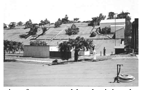
view from ground level, giving the appearance of sloping ground.