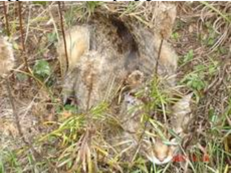
Some natural skillful camouflage.