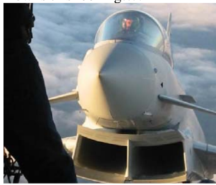
Beginning to look quite good