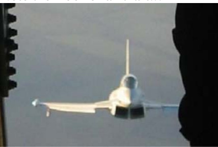
How is this looking...?