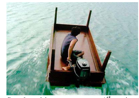
Surely this man gets 1<sup>st</sup> prize. Those below a fair 2<sup>nd</sup> prize