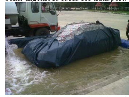
A simple test to see if this will keep water out of the car – but surely it will just float away.

The recent flooding in Bangkok and surrounding areas has resulted some ingenious ideas for transport.