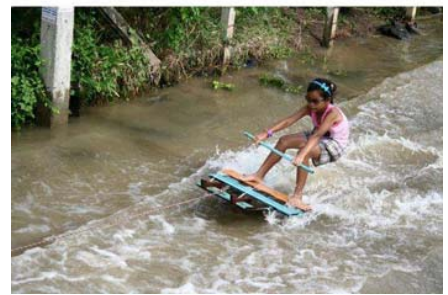
Great fun for kids, being towed by a small motorcycle.