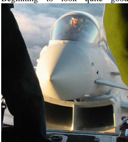
Pilot remarks, I think this is close enough.

We hope the cabin crew had tied everything down and swept the floor thoroughly and zipped all their pockets as this aircraft is the ultimate in vacuum cleaners.