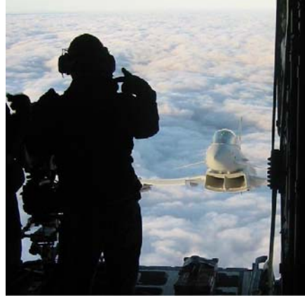
Note the floor of aircraft..!

Radio request to pilot, can you get a bit closer.