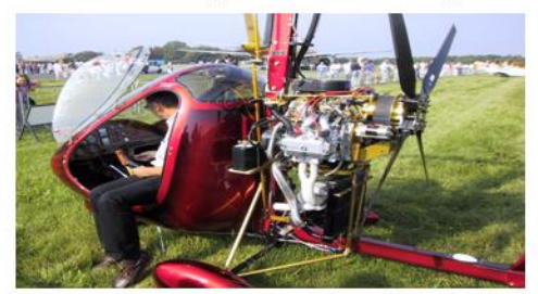
AIRCRAFT SPOTTING This 'hair-um scare-um Gyrocopter was spotted being readied for flight !!! Also this beautifully restored DH Gipsy Moth being carefully polished by an ardent fan !

A1 racing cont: The object of these races is for countries to be able to compete against each other on equal terms with one or two drivers chosen to represent their respective nationalities. So far it looks to be more interesting than F1 which appears to be getting bogged down with different regulations making for dull viewing.