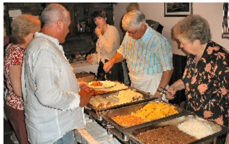
A wonderful well presented meal