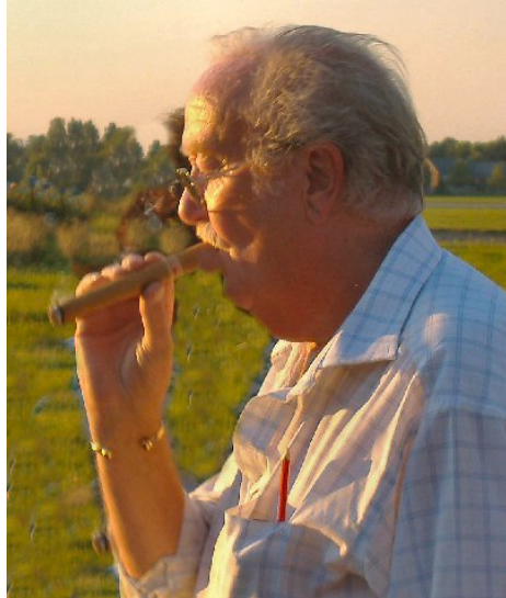
It may better, a little bit downwind.

venture away from the airfield. Whilst we have spoken of the 'last puff' previously in the Bugle, surely these pictures show some confusion as to which way to face when lighting one of these tightly rolled tobacco leaf thingammies .