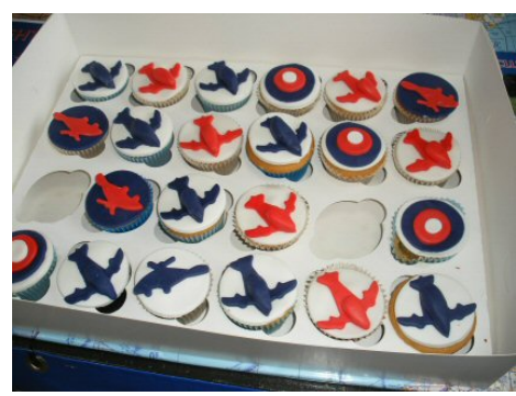
A lot of effort went into the creation of these and they were all scoffed.

However there was plenty of nice food and some very decorative cookies.