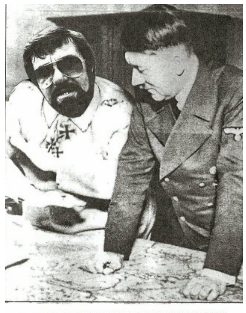
J.B :- IF I WERE YOU, I WOULDN'T START FROM THERE

These afternoon tea parties were very cosy and polite (Note Eva's arm nonchantly draped along the arm rest).