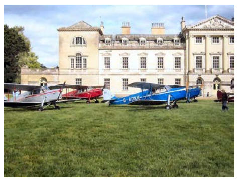
Is this a swarm of Hornets or a clutch of Moths adorning the front lawn of the Abbey.

29<sup>th</sup> WOBURN DH FLY IN Several of the DH stable attended this annual event on the 16<sup>th</sup> August and were lined up in front of the Abbey.