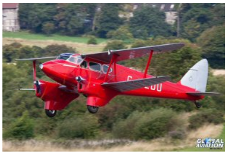
Seems to be a lot of trees around the perimeter today..!!