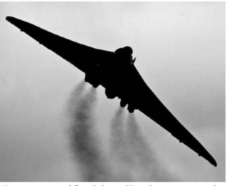
Not sure if this display was in cloudy conditions or just plain pollution.