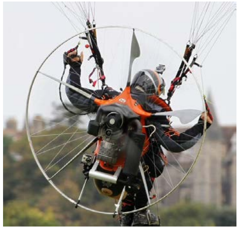
We are not sure if this flight is daring, spectacular, or out of control, certainly thrilling for the pilot and indeed the immediate spectators.