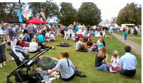
Some of the crowd who attended this beer festival enjoying the sunshine.

Some very big slides for youngsters, assisted trampolines, face painting, food outlets.