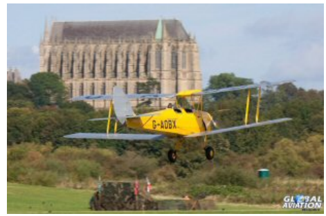
Not only trees, but a very large building (Lancing College) looms closer for this Tiger Moth.