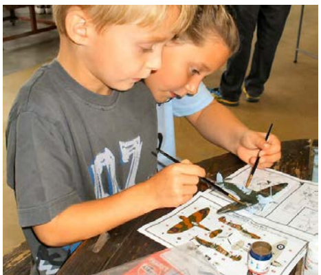
There was a lot of in depth concentration on building model aircraft and painting thereafter.

It was surprising how quickly these youngsters could build and paint these kits from scratch.