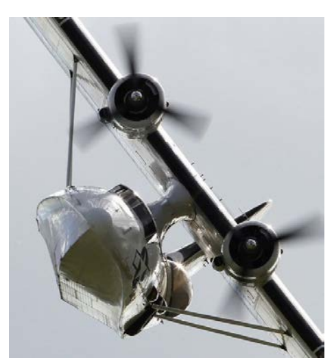
The ever awe inspiring Catalina gave a spirited display.