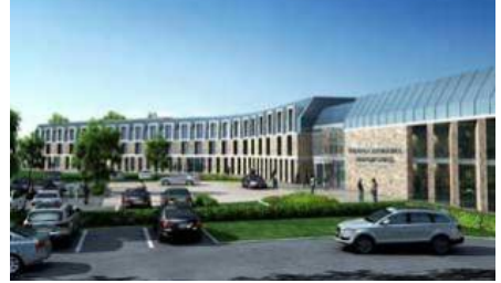
Hopefully these private aviatorsowners will not be excluded from this proposed venture as they have been the bread and butter for this

Hangar nears completion adjacent to the two new flying training establishments of Cabair & EFG the commercial entrance is looking exhilarating for quite those interested in learning to fly. Perhaps, a career in aviation! Not forgetting those already initiated in this cultural art of flying, also the many aircraft owners that have supported the airfield over the years, providing a living for others who maintain their aircraft and the equilibrium of the airfield.