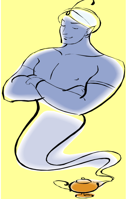
Inciting the mystic powers of the Geni, who may bless this venture

airfield for the last 50 years. Whilst many of these gallant airmen have passed on to that airfield in the sky, their efforts in encouraging aviation, whether it was around the bar, or taking someone for a flight, they were the genuine 'gentleman aviators' not to be forgotten. Without them, all may have been lost years ago. Finally, it is only planning consent that has been granted. We may need to re-polish the old lantern...!