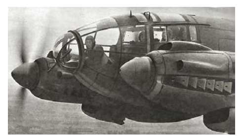
It is very peaceful Wolfgang!!!