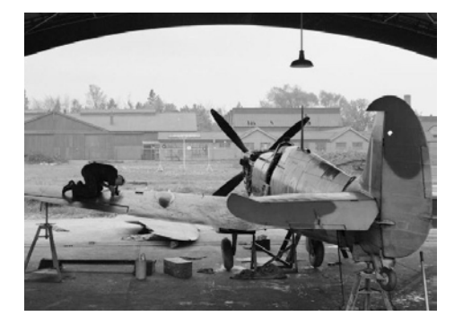
DESPERATE DAYS OF 1940's The spirit of the British never faltered.

Meanwhile at Biggin Hill an armourer works furiously adjusting and sighting the guns of a Spitfire, for the next attack.