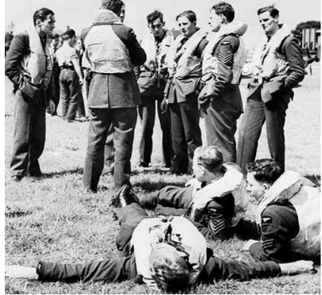
Biggin Hill Pilots at readiness, complete with life jackets.