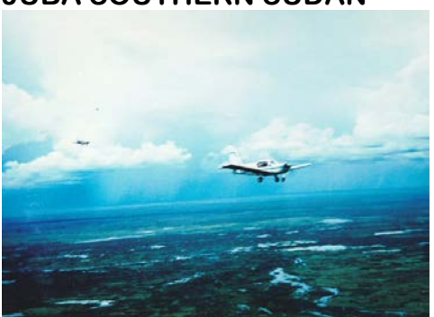
Two aircraft follow downwind as we arrive in a very heavy rain.