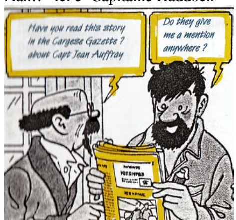
Yes! You have made the tabloids.