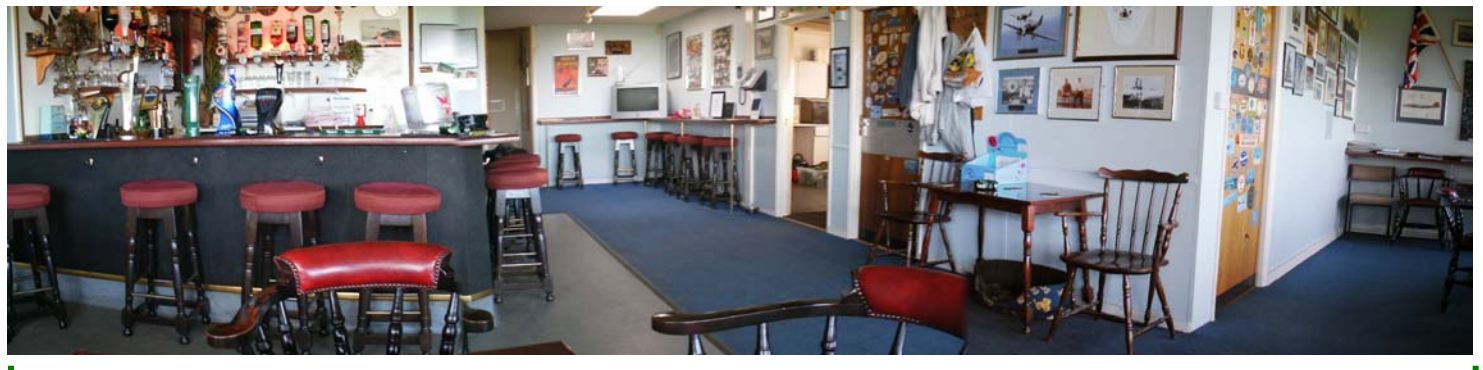
SATURDAY AFTERNOON AT OUR BAR IS BRILLIANT - IT IS QUIET - NO KIDS - EMPTY

DON'T MIND WE KIDS Provided they have their little hands tied behind their backs and are hobbled like a Camel, so that they will fall flat on their little face and smash their little nose. Please ensure they are wearing a hospital mask to stop the blood staining the carpet. This in turn will curtail their efforts to run around high speed at and smashing into the new furniture which could be easily damaged Afterwards they will be given the opportunity to kiss the holly around the Xmas tree.